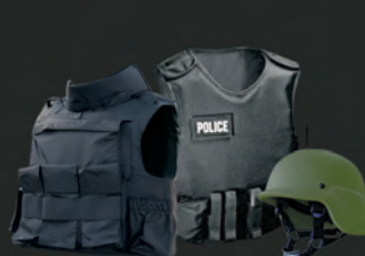
Ballistic Vests & Helmets