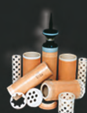
Tank & Artillery Ammunitions