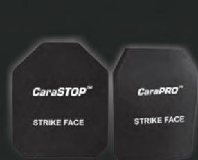
Hard Armour Plates